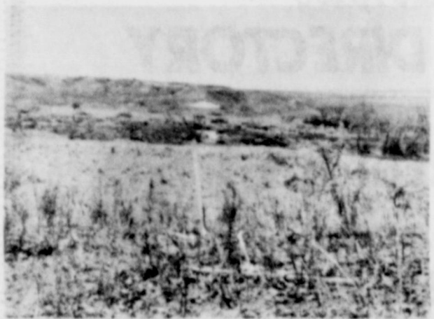
SITE 13 BEFORE CONSTRUCTION