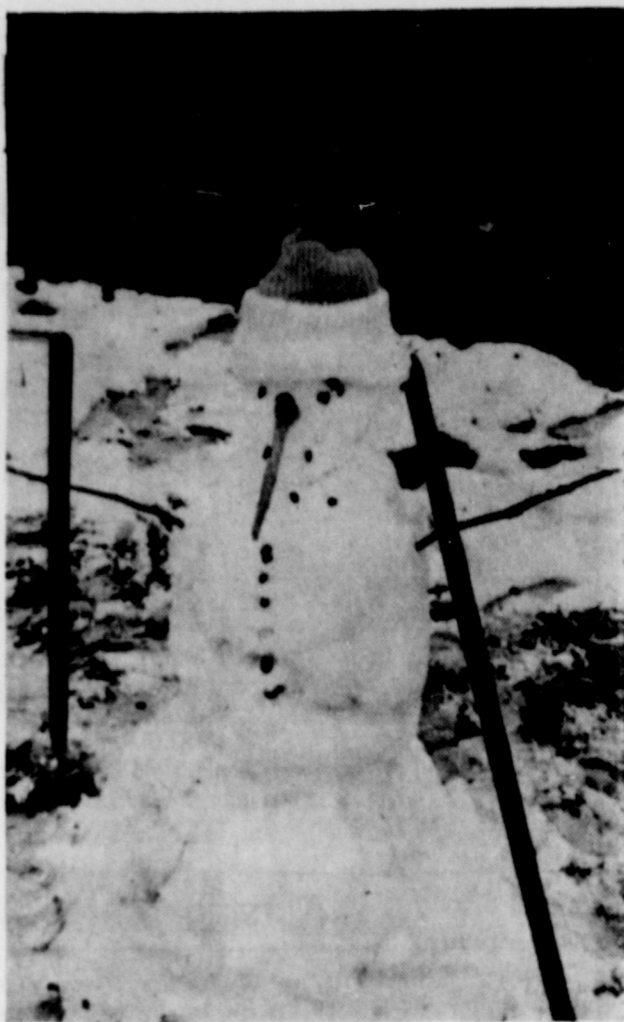
A CARROT-NOSED SNOWMAN decorated a yard in McLean following the surprise snow storm Saturday.

4 eggs (add 1 at a time) 1 cup chopped nuts 1 cup coconut Mix in order given. Pour into greased oblong cake pan. (12x14) Bake at 350 degrees for 35 minutes. This cake rises and then falls. That's why it's called a "sad" cake. DUMP CAKE Margaret Jones 1 can cherry pie filling 1 can crushed pineapple (juice and all) 1 yellow cake mix or cherry chip cake mix 1 cup chopped pecans 1 cup coconut 2 sticks melted oleo Layer ingredients in greased oblong cake pan in order given. Bake at 300 degrees for 1 hour. CHILI RELLENOS CASEROLE Worth Howard 1 cup cream (Half and Half) 3-4oz. can chilies 1/2 cup flour 12 oz. whole green chilies 1/2 lb. Monterey Jack cheese, grated 1/2 lb. Sharp cheddar cheese 1-8 oz. can tomato sauce Beat cream, eggs, and flour till smooth. Split whole chilies, rinse out seeds, drain, and then mix cheese (save 1/2 cup for topping) alternate layers of cheese, chilies, and egg mix in 1 1/2 quart casserole. Pour tomato sauce over top. Sprinkle 1/2 cup cheese on top. Bake 350 degrees for 1 1/4 hours. Serves four.