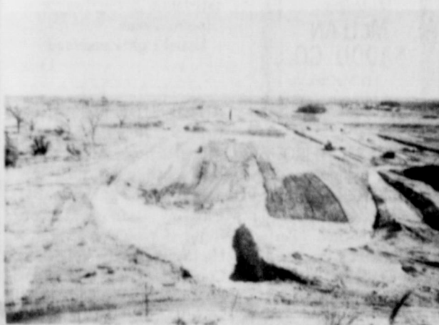
SITE 13 EARLY CONSTRUCTION