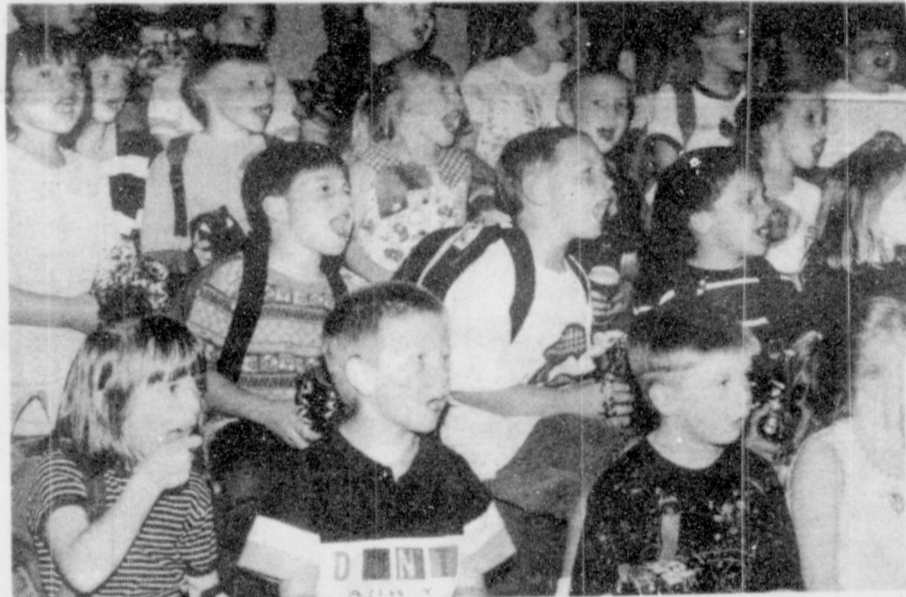
V-I-C-T-O-R-Y! That's the elementary battle cry! These elementary students get into the spirit of things as they rattle their "Big Red" cans and let everyone know that they, too, are Tiger Fans.