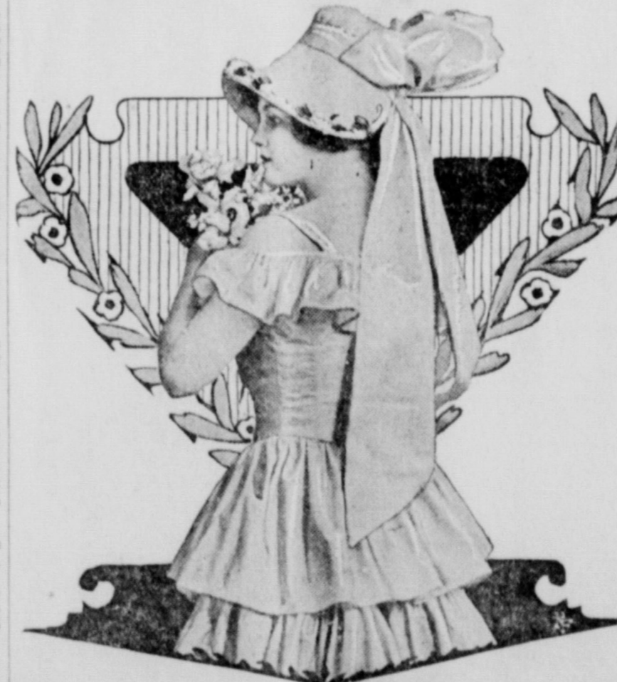
IN THE BRIDAL PROCESSION.

The old-fashioned poke bonnet shown in the picture is covered with plaited chiffon and has a soft crown