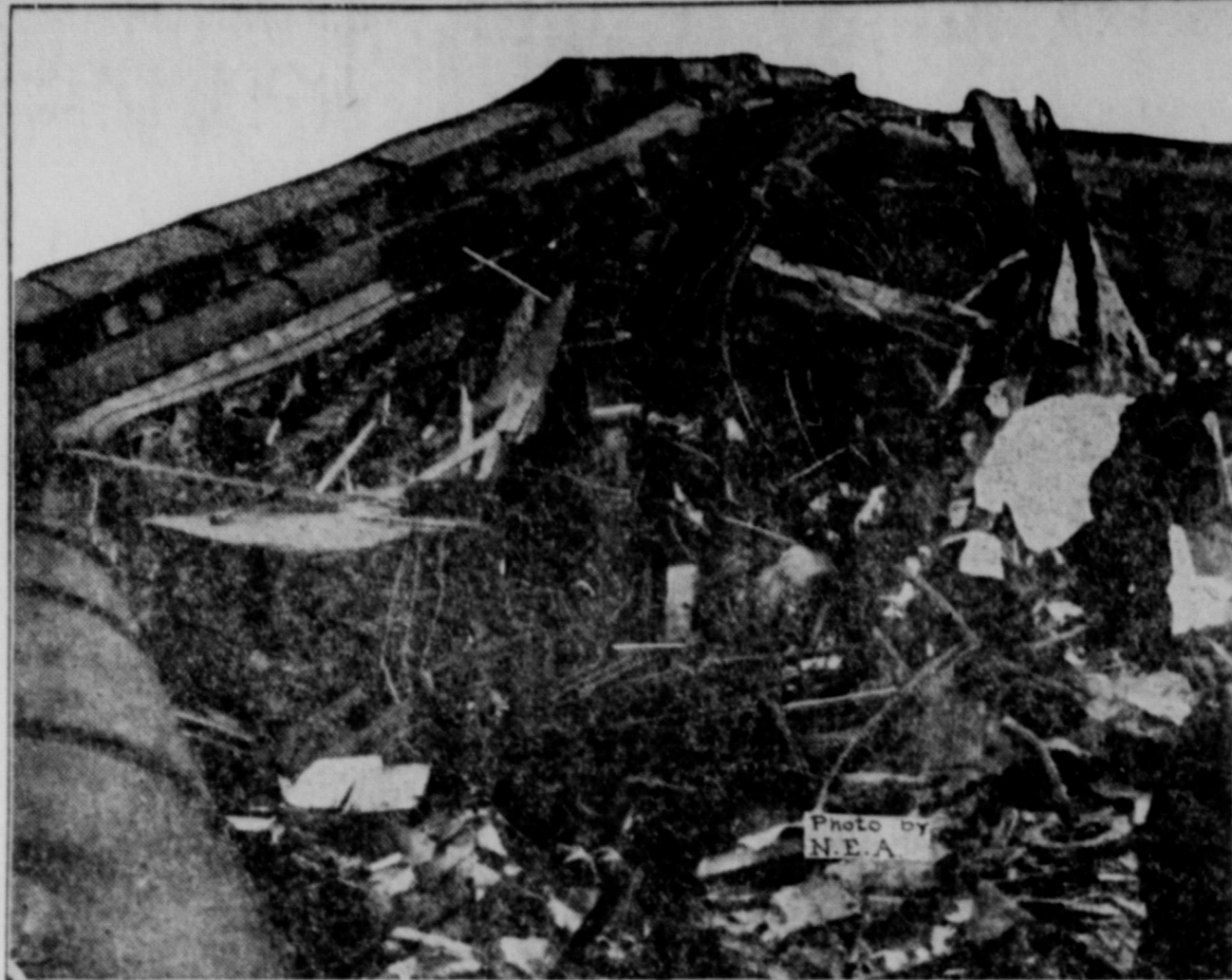
This photograph shows the remains of two Pullman coaches of the first section of the Chicago-Pittsburgh Limited, and the engine of the second section is seen in the debris. The wreck occurred near Amherst, O., and at least 26 persons were killed and 40 injured.