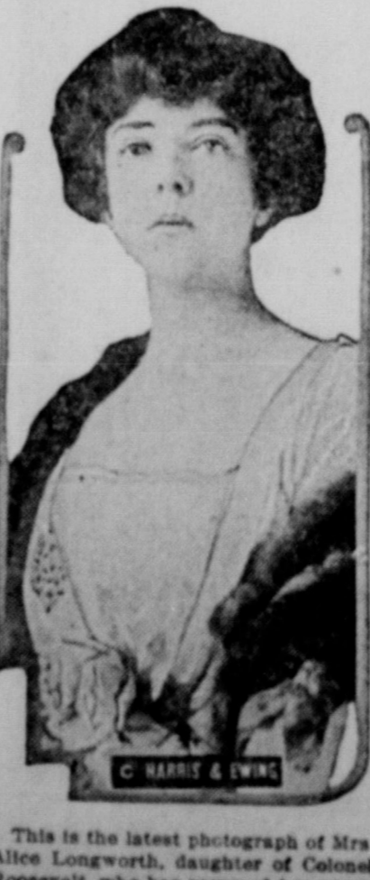
This is the latest photograph of Mrs. Alice Longworth, daughter of Colonel Roosevelt, who has resumed her prominent place in the society of Washington since the re-election of her husband to congress.