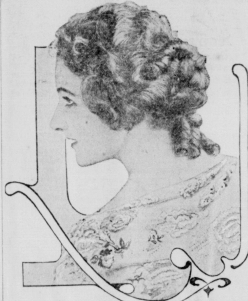
DISTINCTION IN THE COIFFURE.

It is the privilege of the bride to select the style that shall govern in making the costumes of her maids. Just how quaint and picturesque the modes of today allow them to be may be gathered from the illustration given above. This costume looks as if it might be a faithful copy of a style worn by some demure maid who flourished a century ago. But both the gown and the bonnet are products of 1915 and, worn together, they testify to the bride's eye for the picturesque. The gown is made of taffeta. The tight bodice with mid-Victorian shoulders is outlined with a ruffle and