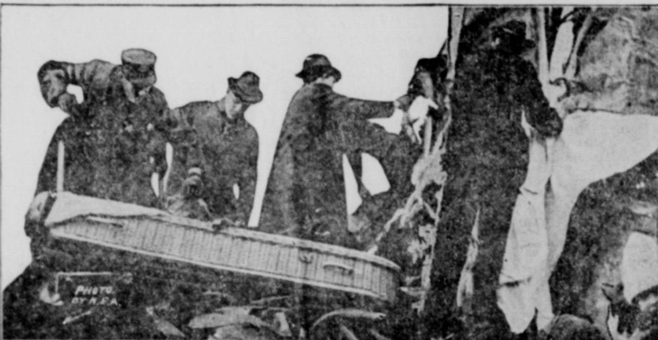
This photograph, taken shortly after the collision near Amherst, O., shows rescuers gathering up pieces of bodies of the victims of the wreck.