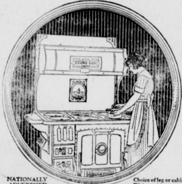
NATIONALLY ADVERTISED Choice of leg or cabinet base With or without reservoir