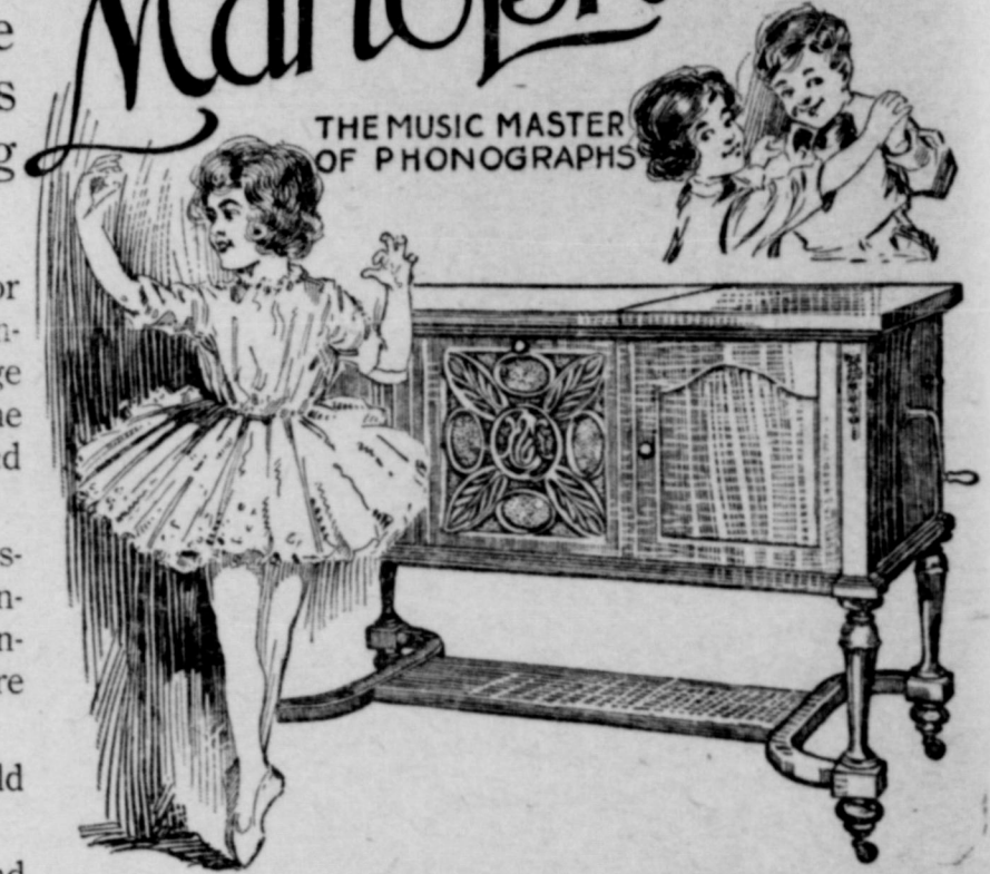
Style L, as Above $375

$62.50 — $95 — $130 — $165 — $215 — $265 — $375