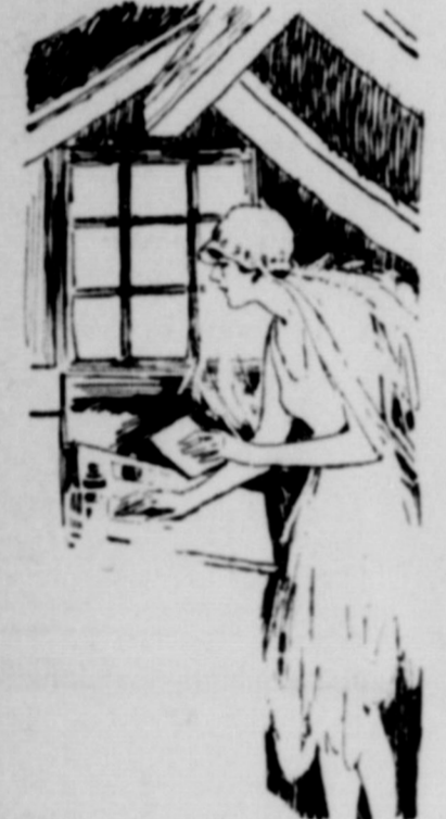
"Oh, Ginger, My Darling." She Whis- pered, and Wept Again for Leav- ing Her.