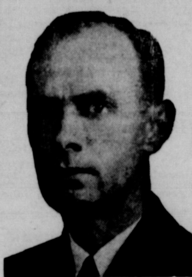
Candidate for District Judge