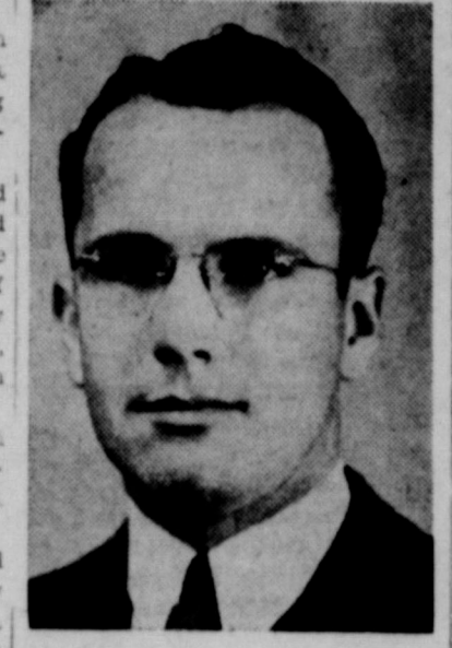
Owner Womack Funeral Homes and Womack Burial Association