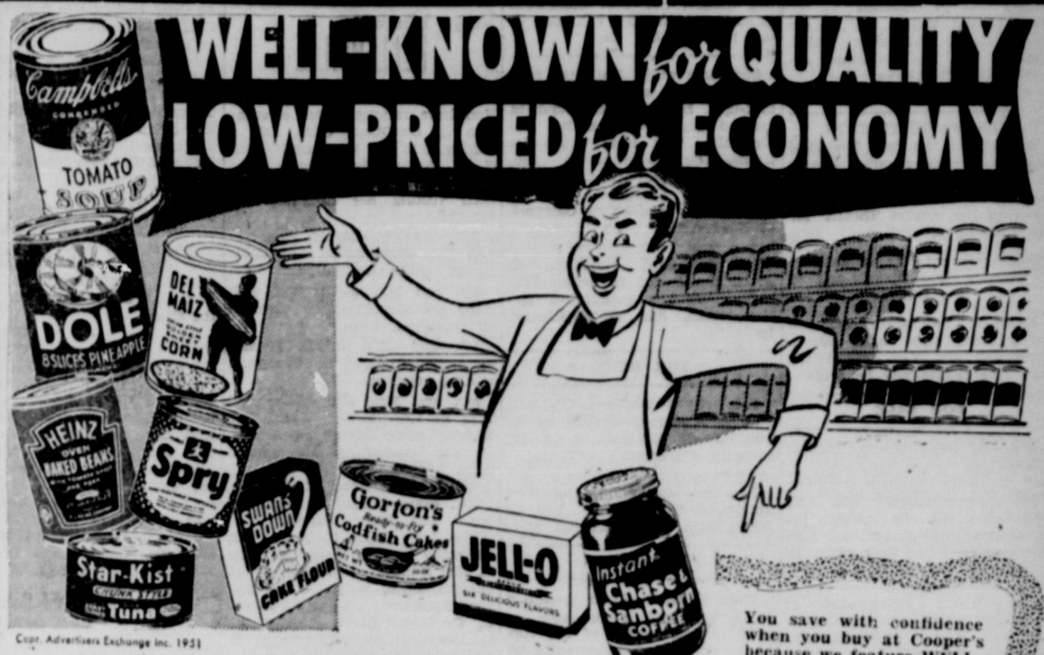
Coop. Advertisers Exchange Inc. 1951

American National Bank IN McLEAN - - McLean, Texas Member Federal Deposit Insurance Corporation Deposits Insured up to $10,000.00 for Each Account