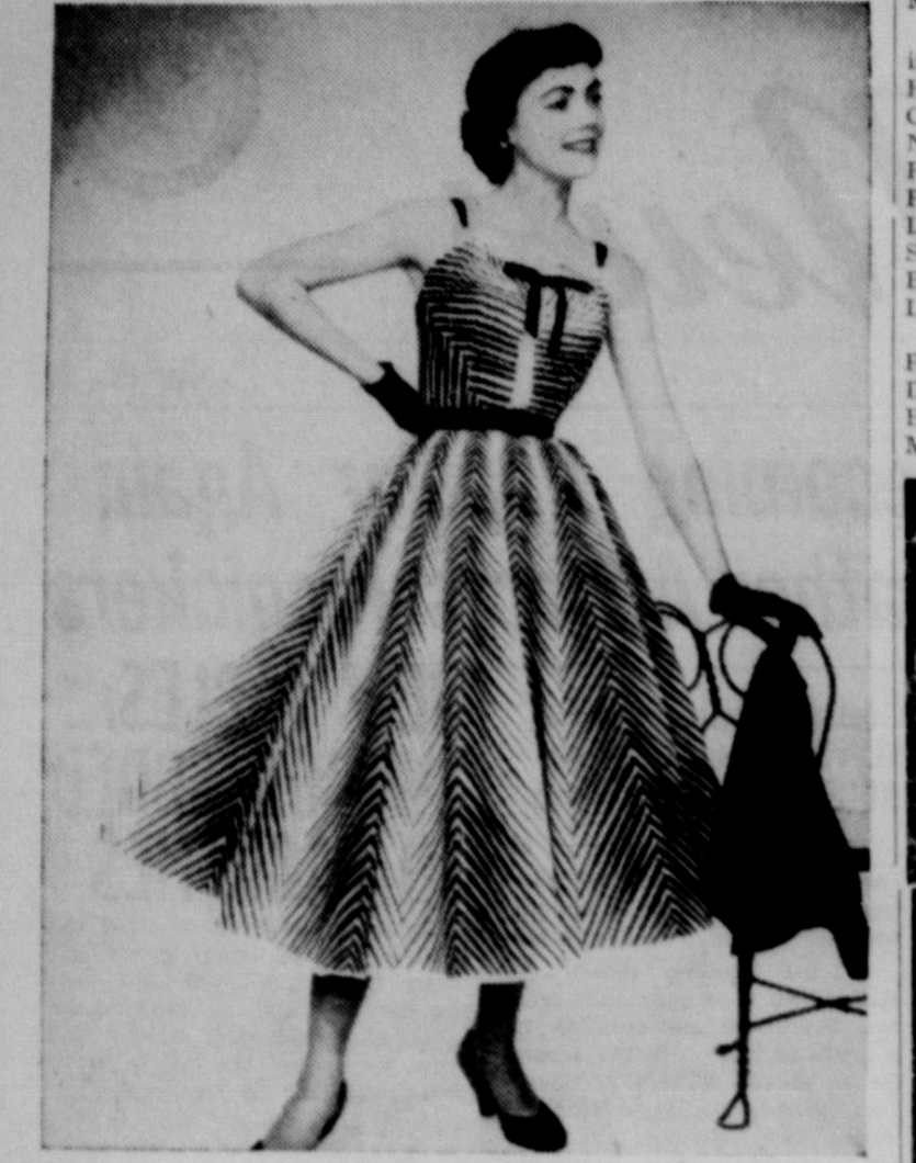
dallas fashion center

Dallas Fashion Center Phote An interesting print in Gro-Mill's chevron pattern is used for a Jeanne Durrell sundress by Kohen, Ligon, Folz of Dallas. The halter top ties with a bow of contrasting color. The flared skirt is a full circle. For cover-up there is a bolero with rolled collar and short sleeves in the contrasting color. White, pink, aqua with black. Sizes 8-14. Retail about 823 00. Style #266 $23.00. Style #386.