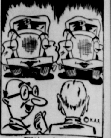
"Which one has the lead?"

Perhaps you can't tell one car from another—but WE can. We know how to check your car properly. For expert lubrication or service... check with us.