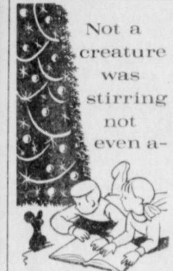
May The Peace And Joy Of An Old-fashioned Christmas Be Yours In Full Measure.

Aunty: "Well, Bobby, how do you like school?" Bobby: "Closed, of course."