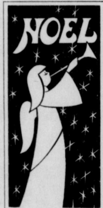
... AND THE ANGELS SANG, FOR A CHILD WAS BORN AT BETHLEHEM.