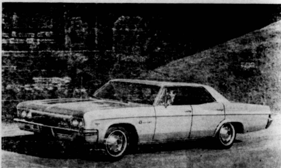
1966 Impala Sport Sedan—a more powerful, more beautiful car at a most pleasing price.

If you haven't examined a new Chevrolet since Telstar II, the twist or electric toothbrushes,