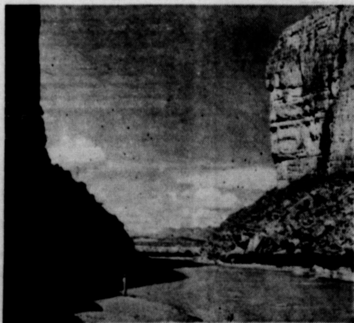
SANTA ELENA CANYON —Thousands of Texans are still "discovering" the awesome wonders of Big Bend National Park, south of Alpine, Brewster County. Here the Rio Grande cuts a 1,500-foot-deep canyon, with Mexico on right and U.S. on left.