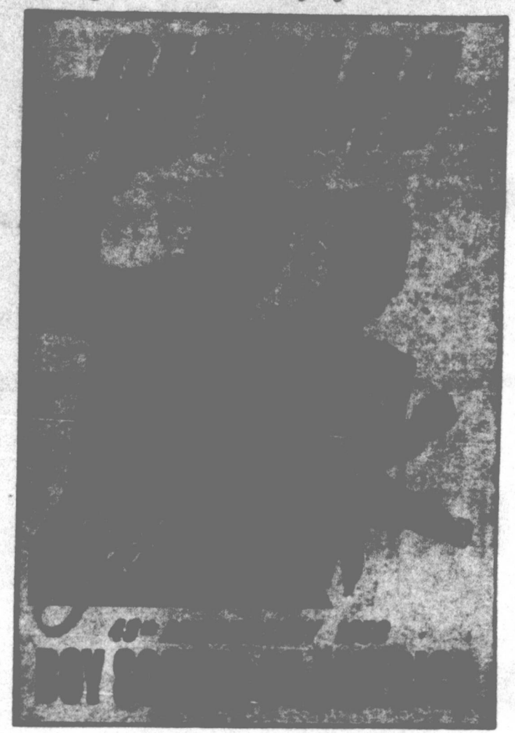
OFFICIAL BOY SCOUT WEEK POSTER

Boy Scouts, Explorers, and adult leaders throughout the nation will observe Boy Scout Week, February 7 to 13, marking the 48th anniversary of the Boy Scouts of America. Boy Scout Week sees the launching of a yearlong Safety Good Turn suggested by Pres-