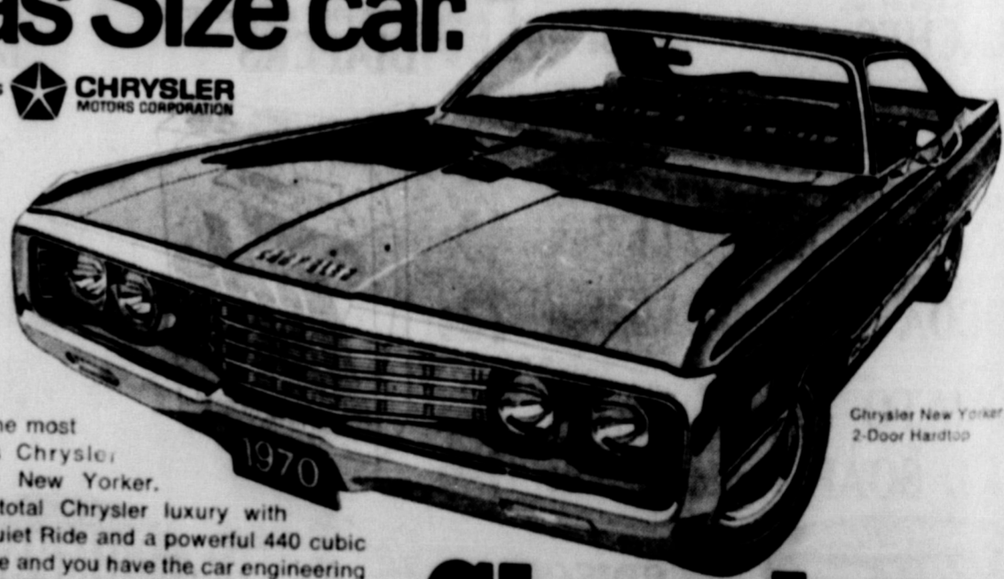
Chrysler New Yorker 2-Door Hardtop

AUTHORIZED DEALERS CHRYSLER MOTORS CORPORATION