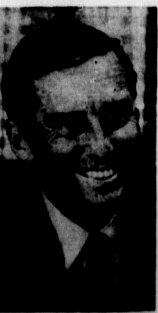
Bentsen Senator for the Seventies