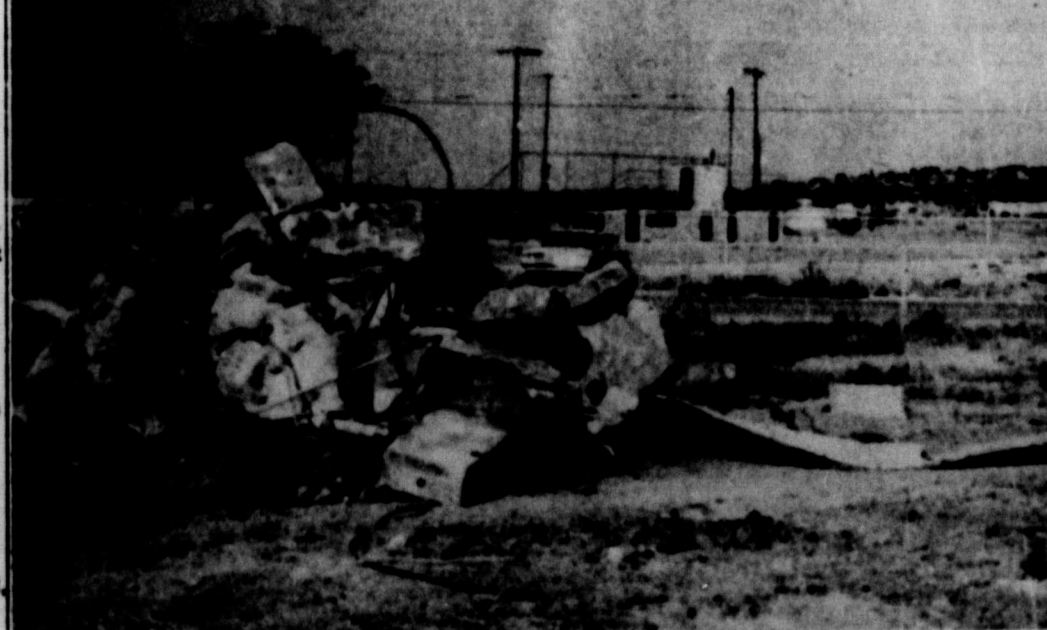
IN THE PATH OF PROGRESS - This pile of broken concrete and reinforcing steel is all that's left of what was the Humble wholesale station in south Ozona. It, along with numerous residences and, looking west, the Little League ball park, part of the county road maintenance headquarters and a business building, all must fall before the bulldozer as Interstate Highway 10 crosses through Ozona. Contract letting for this section of the super highway, however, is still in the uncertain future.

Crockett County has never had facilities for women or (continued on last page)