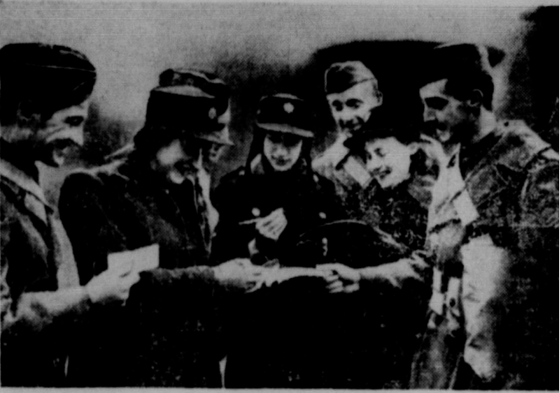
United States soldiers, part of the A. E. F., who have just arrived in London, are shown making friends with British girls in uniform. According to the British caption which came with this photograph, they are exchanging "autographs."