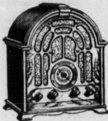
Long and Short Wave Table Model

Short Wave Reception With an RCA-VICTOR "GLOBE TROTTER"