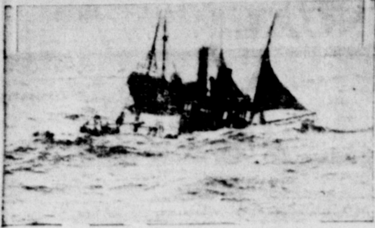
This photograph from Aberdeen, Scotland, shows not a wreck but a trawler in the trough of a huge wave as another trawler passes by. The boats were leaving the harbor for the fishing grounds.