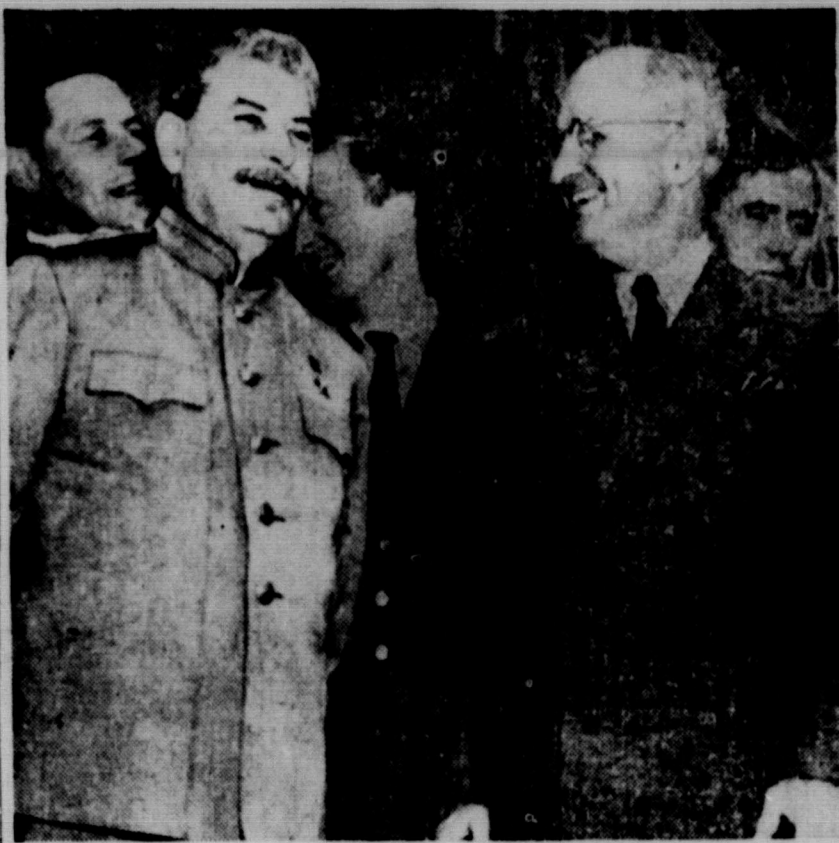
Just a couple of the boys enjoying a good laugh. President Harry S. Truman and Marshal Joseph Stalin are pictured during an informal moment preceding one of the Big Three meetings in Berlin's Potsdam suburb.