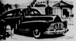
More Value in All-round Safety

You'll find that Chevrolet gives you riding-smoothness, more ride-steadiness, on all kinds of roads—because it has the original Unitized Knee-Action Ride, proved and perfected by 14 years of experience building Knee-Action units, available only in Chevrolet and higher-priced cars!