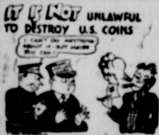
Proof Next Week