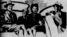
More Value in Riding Comfort

You'll find that Chevrolet gives you riding-smoothness, more ride-steadiness, on all kinds of roads—because it has the original Unitized Knee-Action Ride, proved and perfected by 14 years of experience building Knee-Action units, available only in Chevrolet and higher-priced cars!