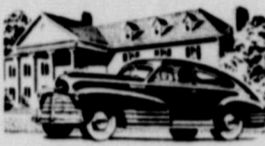
More Value in Beauty and Luxury

There's nothing like Chevrolet's world's champion Valve-in-Head engine . . . with its record of having delivered more miles of satisfaction, to more owners, over a longer period, than any other engine built today . . . and Valve-in-Head design is exclusive to Chevrolet and higher-priced cars!