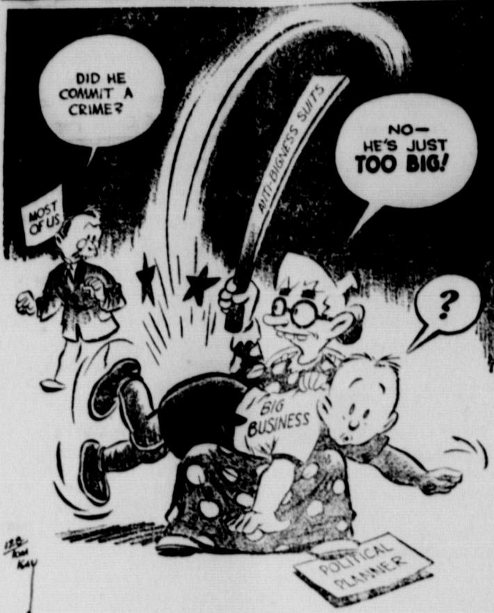
Wrong guy on the knee