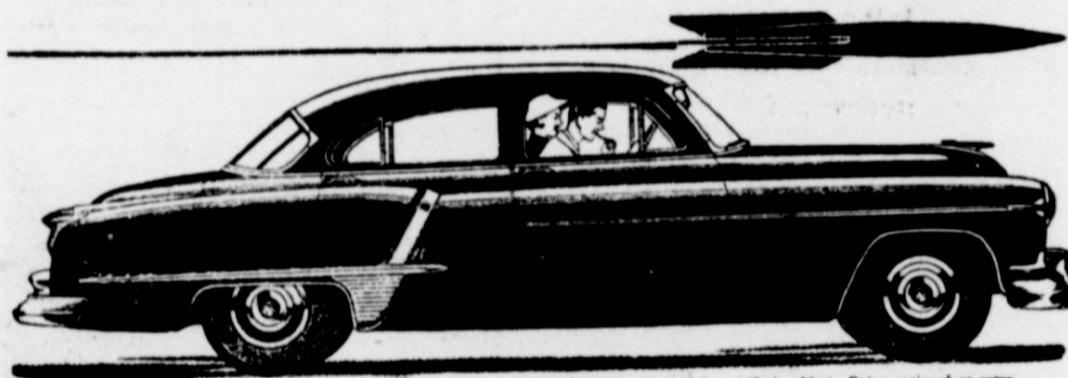
Product of General Motors

The "Rocket" has really got it... and the proof is in the driving! Try Oldsmobile's new Super "88"! Learn about "Rocket" performance and "Rocket" economy—flashing action and real gas savings! Learn about "Rocket" smoothness as this great power plant teams with the magic of Hydra-Matic! Drive a new Oldsmobile and discover the top engine in motoring today... OLDSMOBILE'S "ROCKET"!