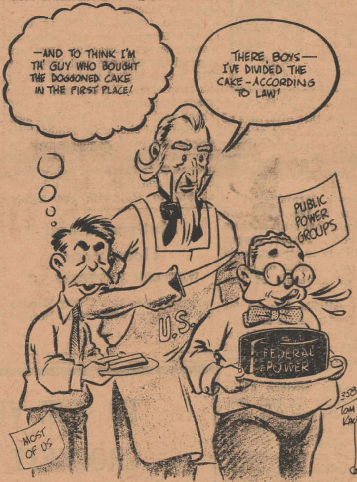
Is This Equality?