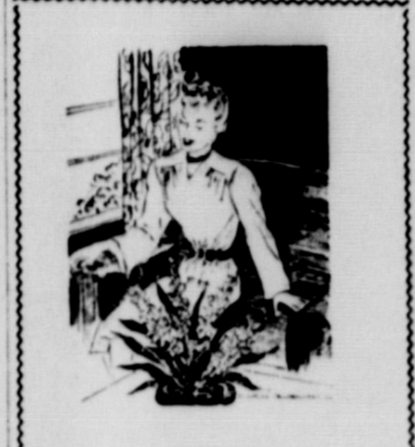
TIME FOR A "NEIGHBORLY" GESTURE

If inventory is made now while memories are fresh, there will be less chance of overlooking some of the loss. Loss figures, computed by taking a fair market value be-