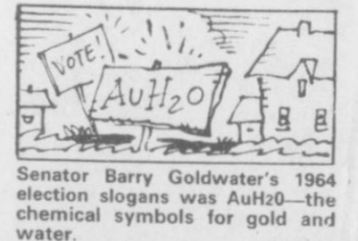
Senator Barry Goldwater's 1964 election slogan was AuH2O—the chemical symbols for gold and water.