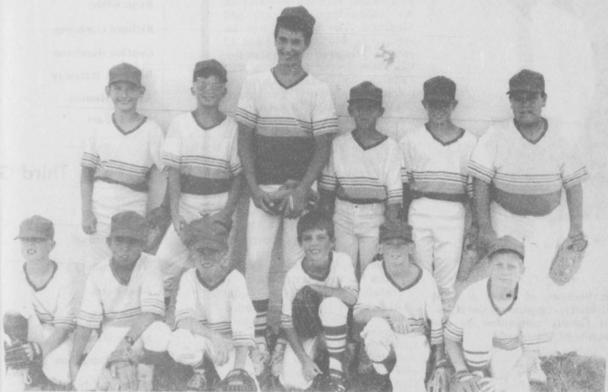
Little League Green Team are ready to play a double hitter Thursday night.