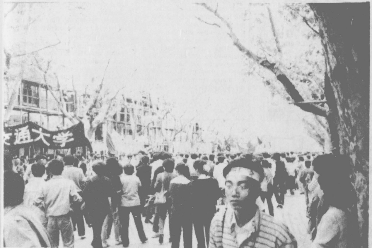
Students gathering in downtown Shanghai to demonstrate in May.