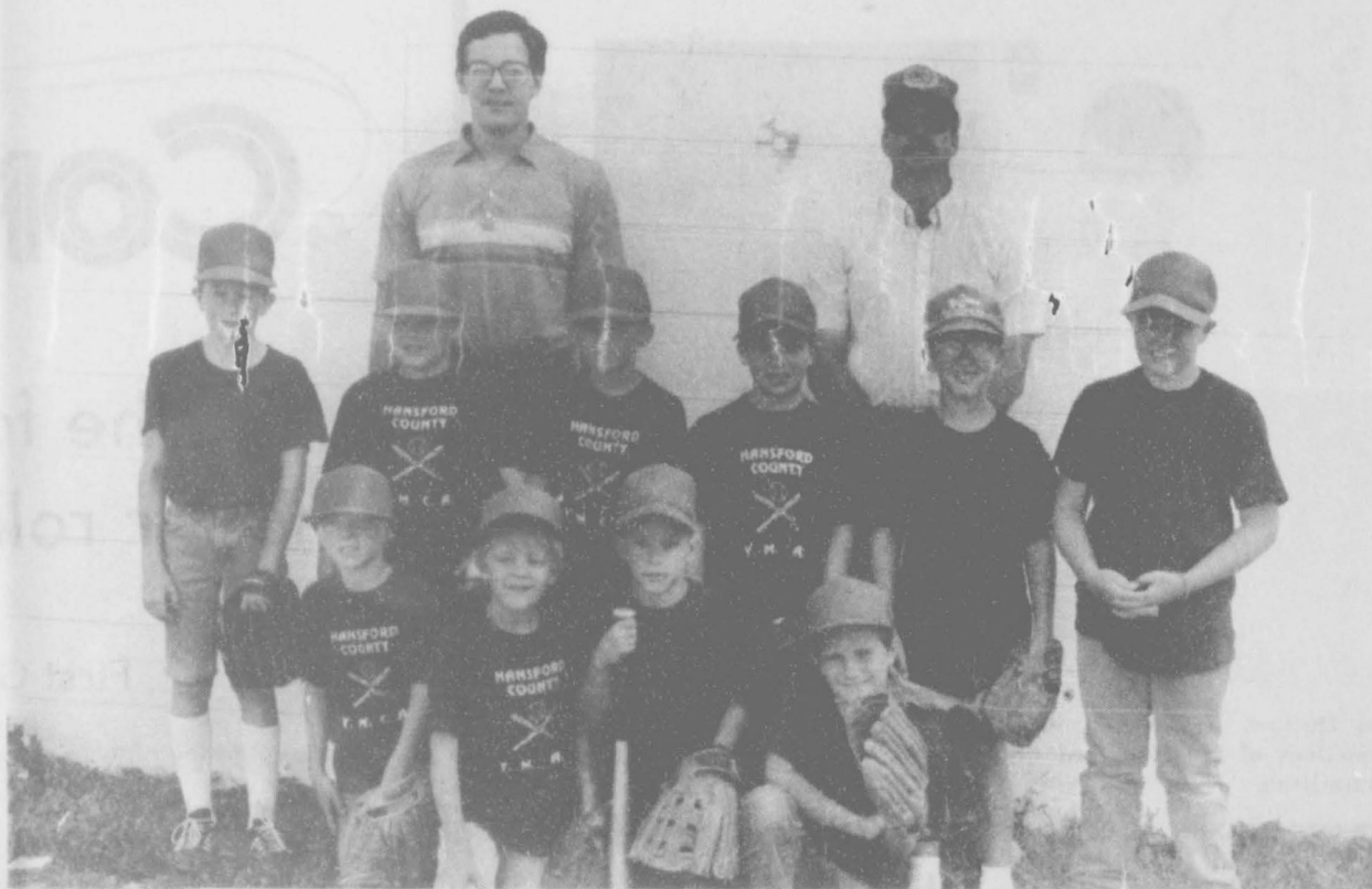
Spearman coach - pitch baseball team take their 2 - 3 record into their last game Thursday night.