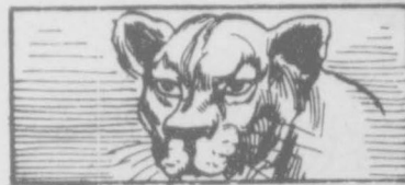
Female lions do over 90 percent of the hunting for the pride.