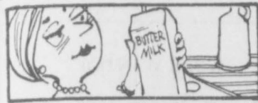
Always keep cultured buttermilk chilled. If it becomes warm, it may separate. If it does—stir it.