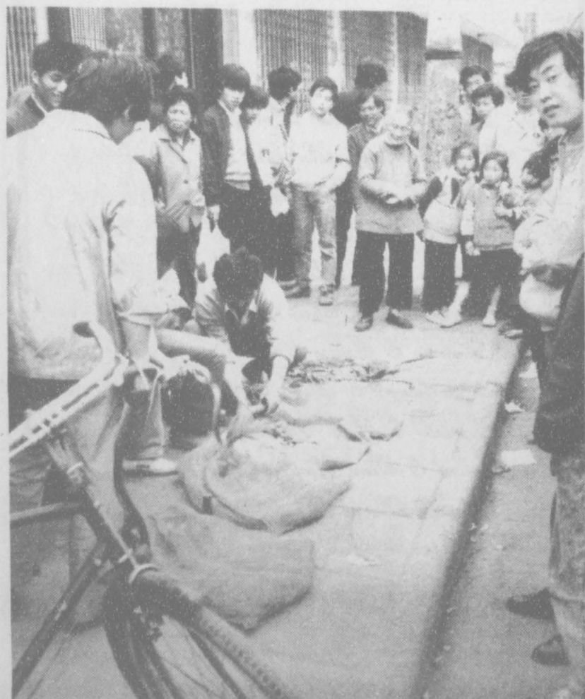
The snake vendor with his live snakes [generally in the bags.]