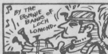
The bagpipe is an old instrument. It is spoken of in the Old Testament and it was used by the Egyptians, Greeks and Romans.