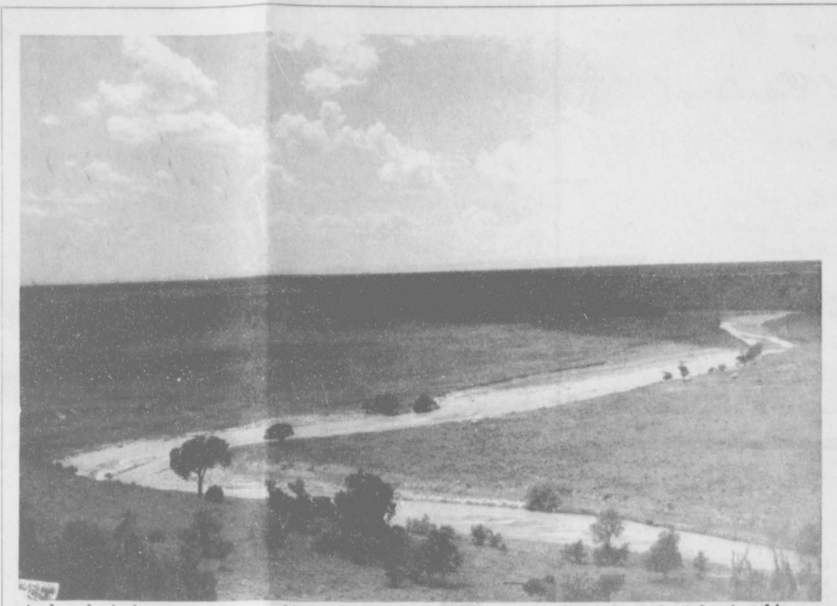
Archaeological crews are working the stream terraces to the left and right in this picture. Volunteers are helping. This is an overall view of the area from Hwy. 207.