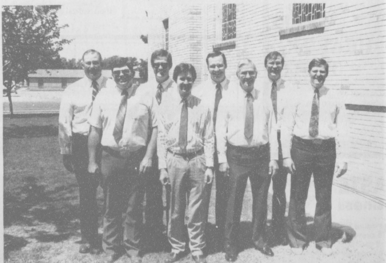
Servants of the Faith will be leading the evening worship service today, June 11, at First Baptist Church. The service will begin at 7:00 p.m. This time of praise and worship will be a special service featuring this group of Christian laymen who are committed to sharing the love of God through music.