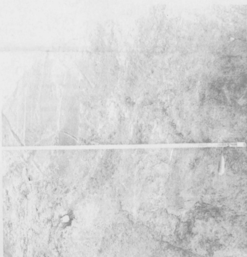
Ancient pond sediments are being studied, looking for Indian camps. The tape measure in the picture shows the dimensions of the pond. Studies in this area show that these places are from 1,700 to 10,000 years old. It was in one such pond area that Alibates flint was found.

These studies must be done to satisfy the law, but the people in the district will get a lot more than see TEST p. 3