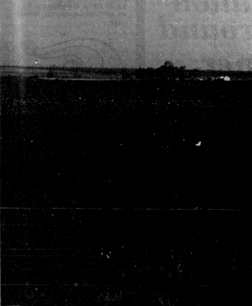
DESPITE THE WHEAT FREEZE, fields in Hansford county are coming in strong. This picture, taken about two miles north of Spearman off the Airport Road, shows a sample of the some 160,000 acres which will be cut

this summer. Hansford farmers will be making decisions within the next two weeks to determine what will be listed as failed and what will be allowed to grow for harvest.