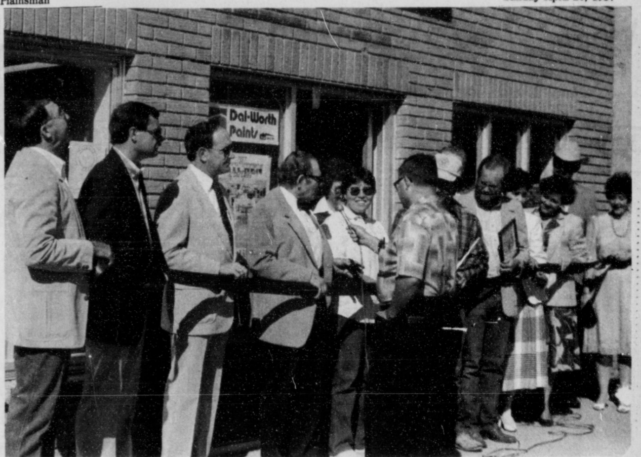
GRAND OPENING... McClure's Paint and Supply celebrated their grand opening with a ribbon cutting in

Do not consider perennials as permanent plants. Replanting, dividing old plants, and preparing the soil are essential for vigorous, flowering plants.