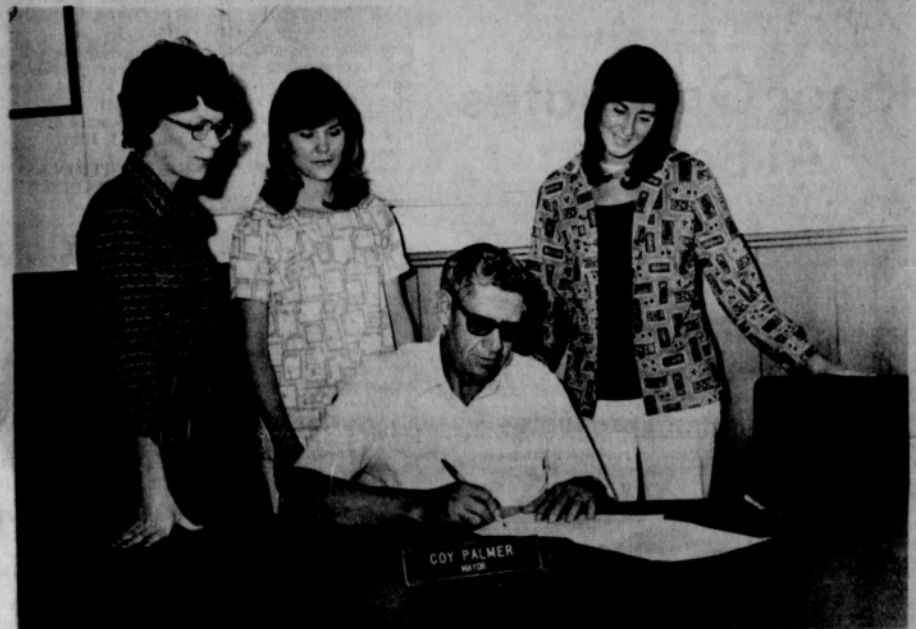
MAYOR COY PALMER is shown here signing a proclamation naming Cystic Fibrosis week in the city. Shown with the mayor are left to right, Candy Boxwell, Janie Henton and Betsy Neff.

office valuation in Hansford County is estimated at $40,500,000. The $1.75 tax rate is broken down into these categories: .12¢ to the state, .97¢ to the county, .30¢ to special roads, .25¢ to the hospital district, .06¢ to Palo Duro River Authority, and .05¢ to the water district.