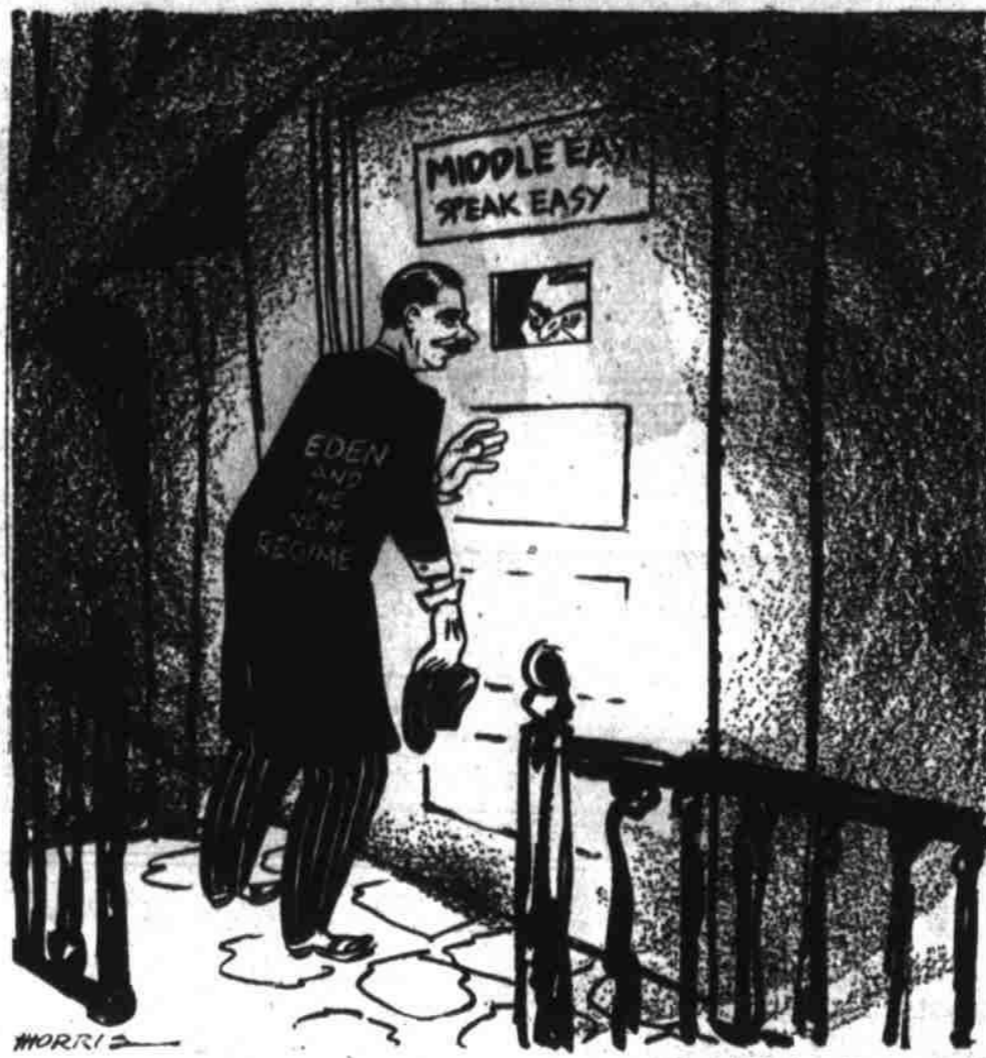
The Right Password?

Published weekly except on holidays... Subscription rates: $2.00 per year in advance... 4 Big Spring Herald, Mon., Nov. 12, 1951