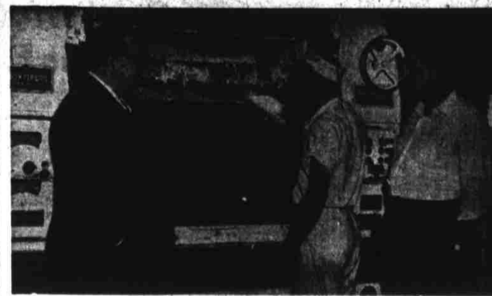
New Bread Formula

RANGOON, Nov. 12. (U)—A special Burmese court acquitted "Burma Surgeon" Dr. Gordon S. Seagraves today of aiding a rebel leader, and set aside his conviction by a high court.