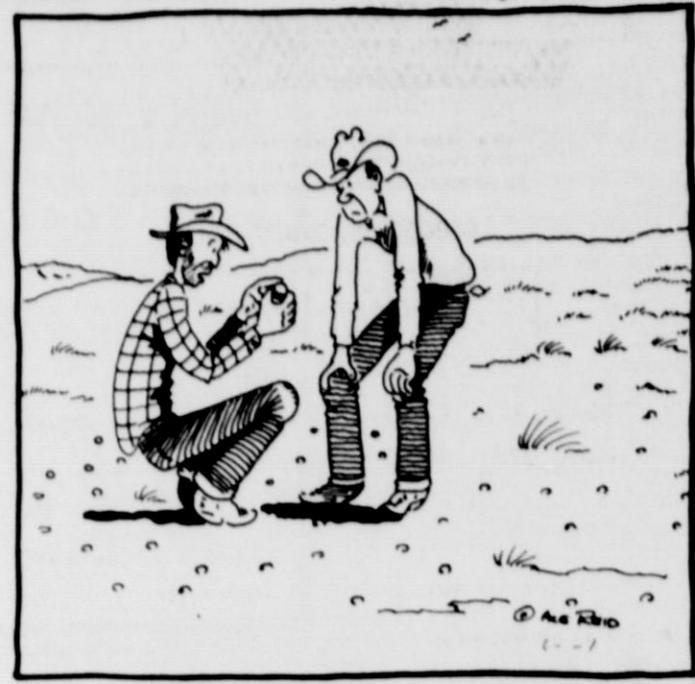
"Oh, our rocks on this place usta weigh around ten pounds, but this Spring the wind has blowed so hard — it's about wore 'em to nuthin!"

This feature sponsored by THE FIRST STATE BANK