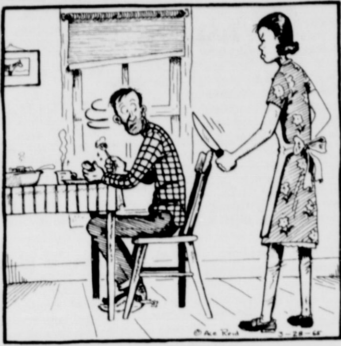
"The meat's fried too hard, the biscuits are soggy and the coffee's weak . . . but . . . but, that's the way I like 'em!"

This feature sponsored by THE FIRST STATE BANK