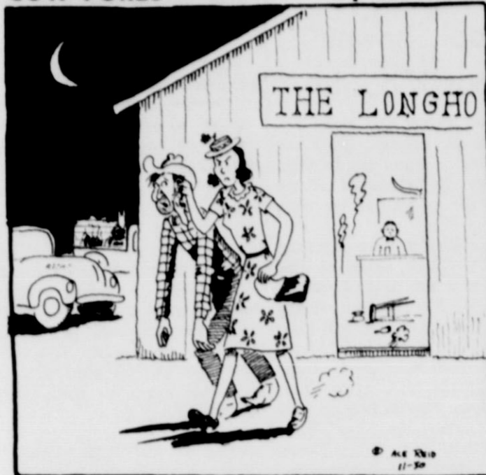
"Now, Maw, I jst finished tellin them ole boys how sweet, tender and understandin' you were, then you made a liar out of me!"

This feature sponsored by THE FIRST STATE BANK