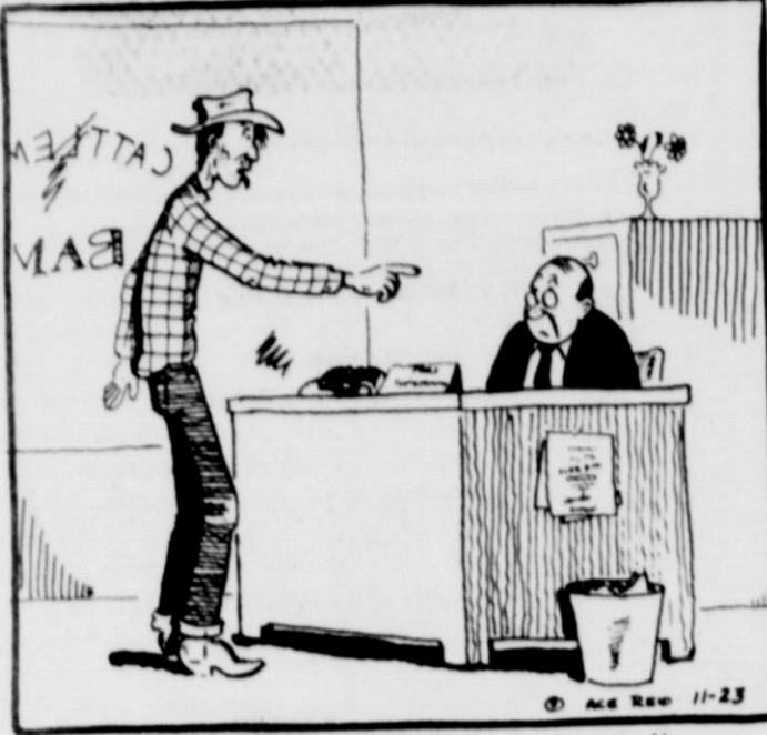
"Now, Mr. Banker, jist because you were the one that loaned me the money to buy them calves that I jist lost money on . . . I want you to know I ain't mad at you!"

This feature sponsored by THE FIRST STATE BANK