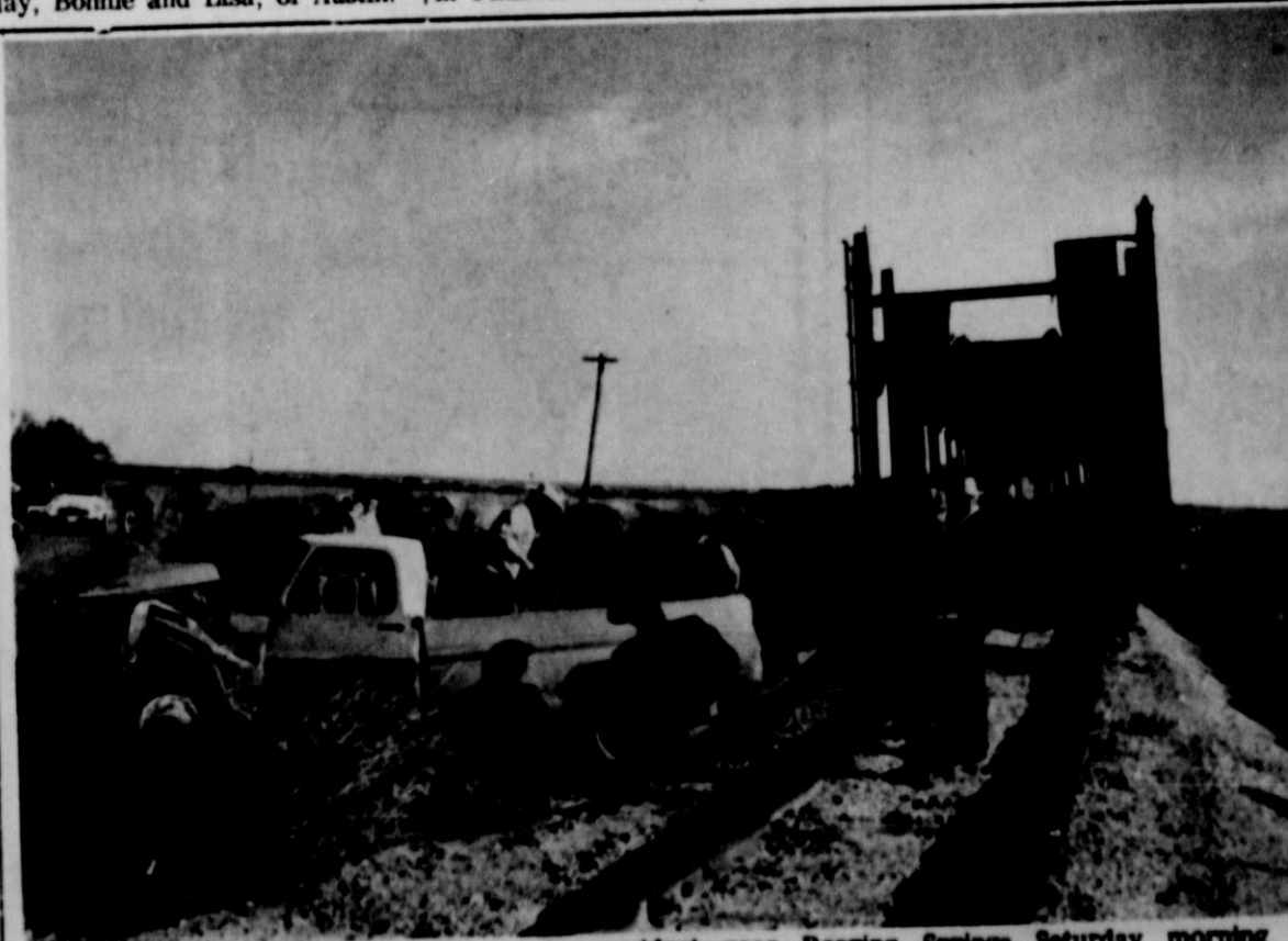
SCENE OF RAILROAD grade crossing accident near Roaring Springs Saturday morning in which two residents were seriously injured. The Q. A. & P. Ry. freight train was east bound from Floydada.