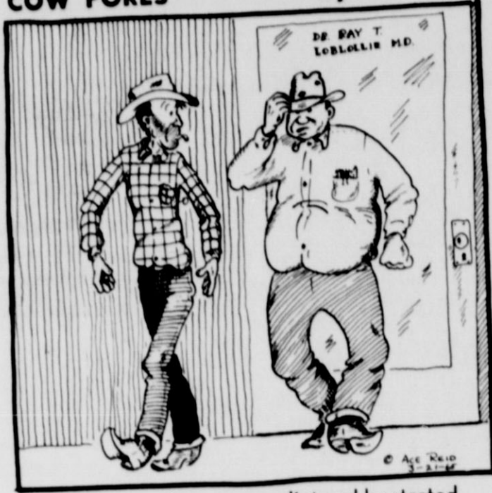
"The Doc said to go on a diet and he started by lighten my wallet fifteen dollars!"

This feature sponsored by THE FIRST STATE BANK