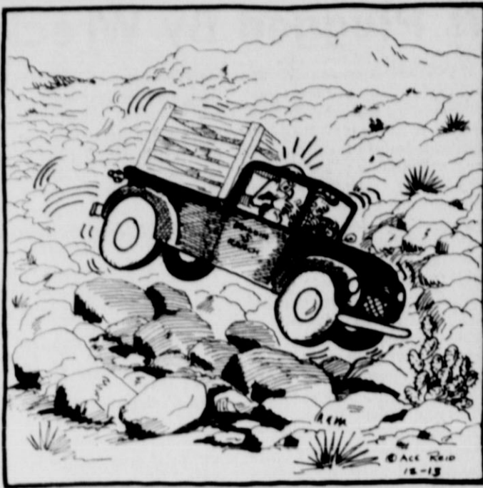
"Hey, don't these pickups beat gittin' yore insides shook up on them ole rough hosses!"

This feature sponsored by THE FIRST STATE BANK