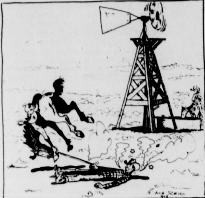
"Aw right, so I ain't much of a bronc rider, but I'm still a heck of a good wind mill greaser!"

This feature sponsored by THE FIRST STATE BANK