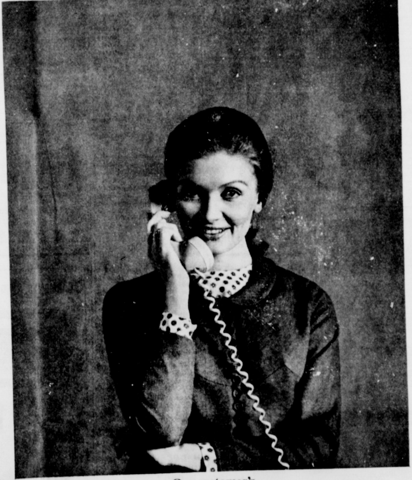
Our customer's representative is a good listener