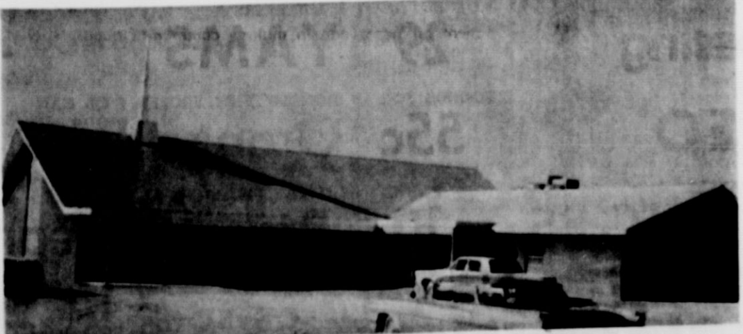
THIS BEAUTIFUL NEW CHURCH IS CERTAINLY AN ASSET TO ROARING SPRINGS AND A CREDIT TO THE CONGREGATION

We Share Your Pride Bob Stanley Pharmacy "ONE OF THE LARGEST AND FINEST PHARMACIES IN WEST TEXAS"