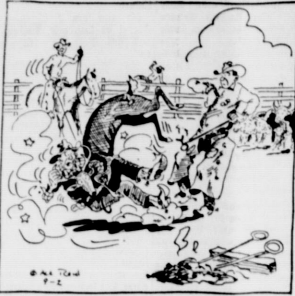
This feature sponsored by THE FIRST STATE BANK