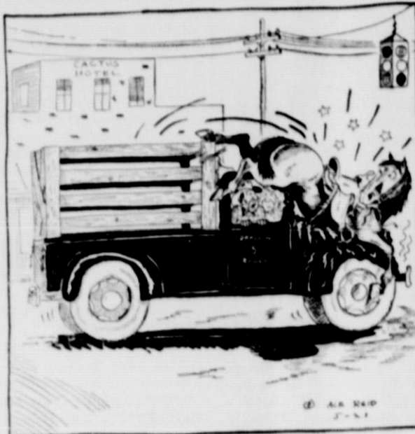
By golly, you do have good brakes.

This feature sponsored by THE FIRST STATE BANK