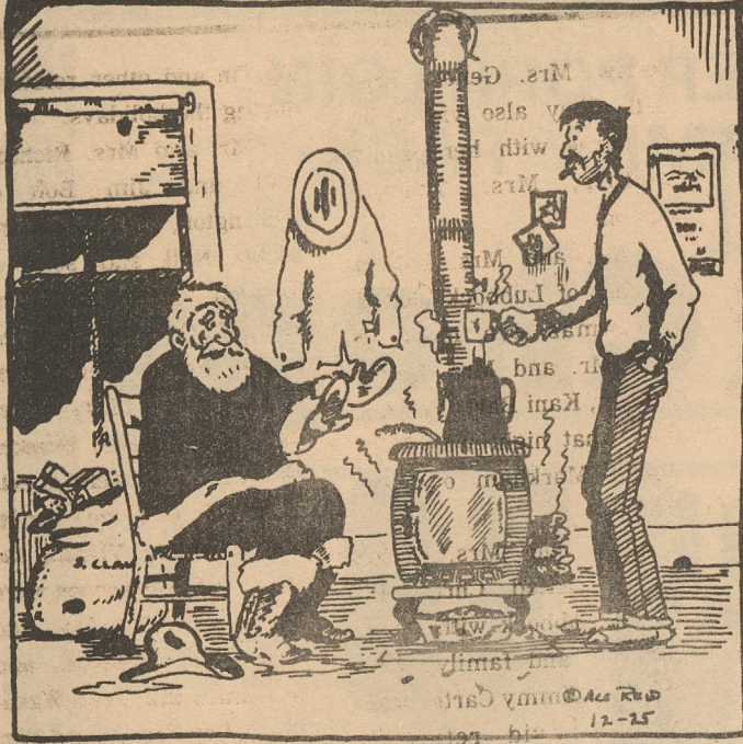
"Jake, I reckon I'm gonna hafta git outta this business... the price of raindeer feed is plumb outta reason!"

This Feature Sponsored By FIRST STATE BANK