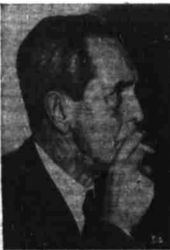
TWO RESULTS are possible from any neutrality policy, Breckinridge Long (above), former ambassador to Italy, told the Senate foreign relations committee. He said any such legislation "either will get us into war, or it will keep us out."