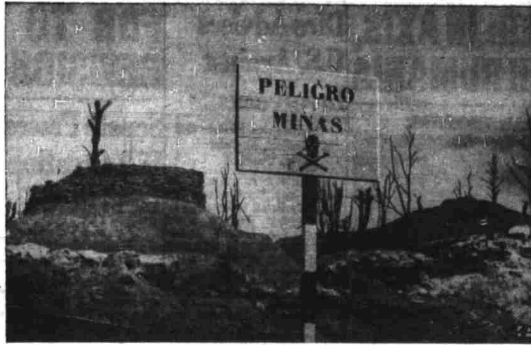
WAR'S GHOST STALKS THE BATTLEFIELD at Madrid in the form of unexploded mines, a silent peril long after the fighting ceased. Here is a sign, "Danger Mines," warning visitors in the University City sector to keep away from the deserted area. Three children, playing on the battlegrounds, were killed in explosions in the first week following surrender of the city. Ruins of buildings, too, presented a menace.