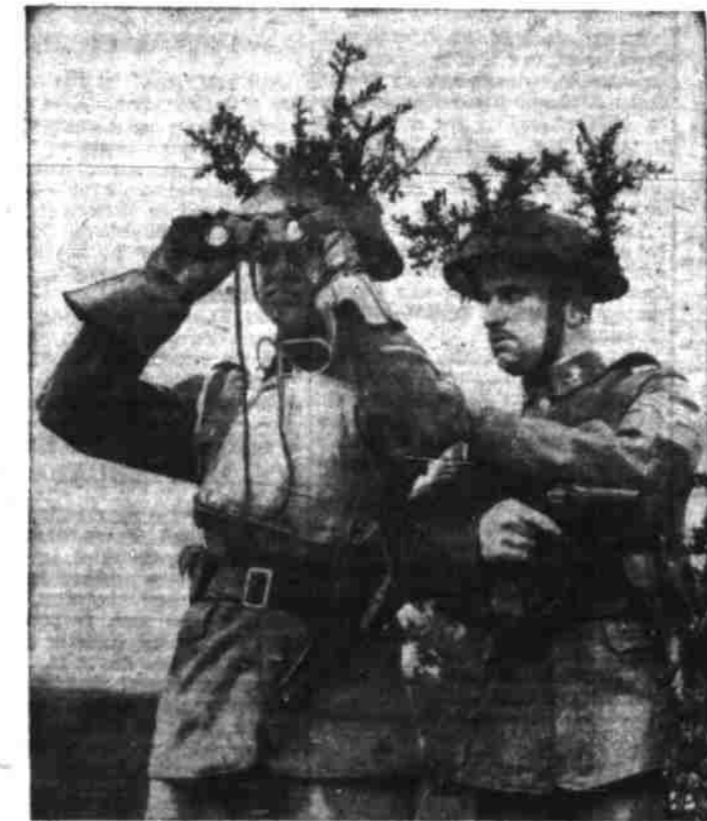
ARMY TWIGGER MEN are these British soldiers who have used leaves and twigs to disguise themselves as trees. They demonstrated the outfits, small branches inserted in burlap helmet covers, at war games for king and queen at Aldershot, England.