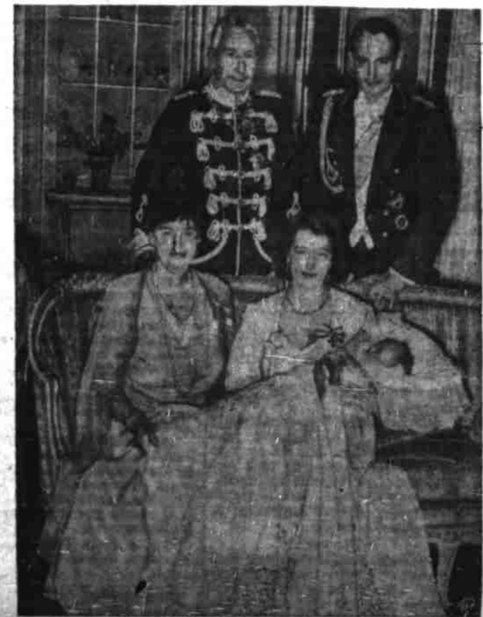
BIG NAME has Prince Louis Ferdinand Friedrich Wilhelm Hubertus Michael Kyriell, two-month-old son held by mother, former Duchess Kyra of Russia, at Potsdam, Germany. At right is father, Prince Louis Ferdinand; at left, grandpa, Crown Prince Friedrich Wilhelm, and grandma, Crown Princess Cecilie.