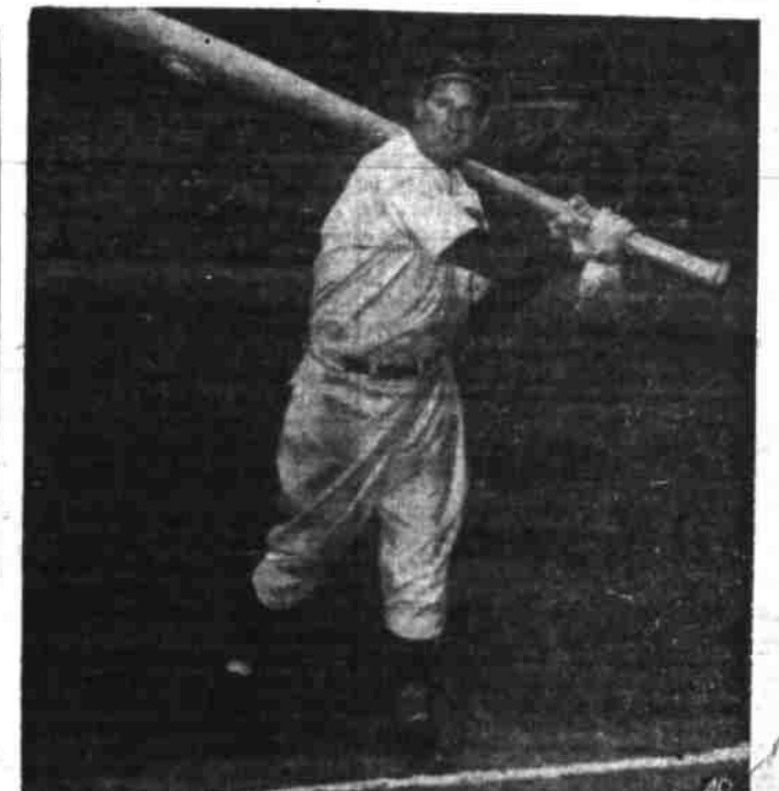
HE DOESN'T NEED THAT six-foot bat to hit the ball, for Ernie Lombardi of the Cincinnati Reds was the National League's leading hitter last season. His hitting is a major factor in the Reds' bright prospects for this year.