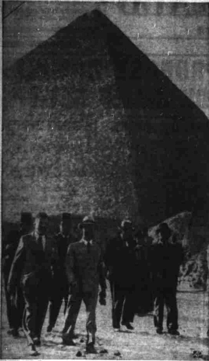
SILENT AS THE SPHINX was Germany's propaganda chief, Dr. Joseph Goebbels, when he visited Egypt, requested by that government to refrain from public statements during his stay. He is shown, center, trudging past age-old pyramids near Cairo.