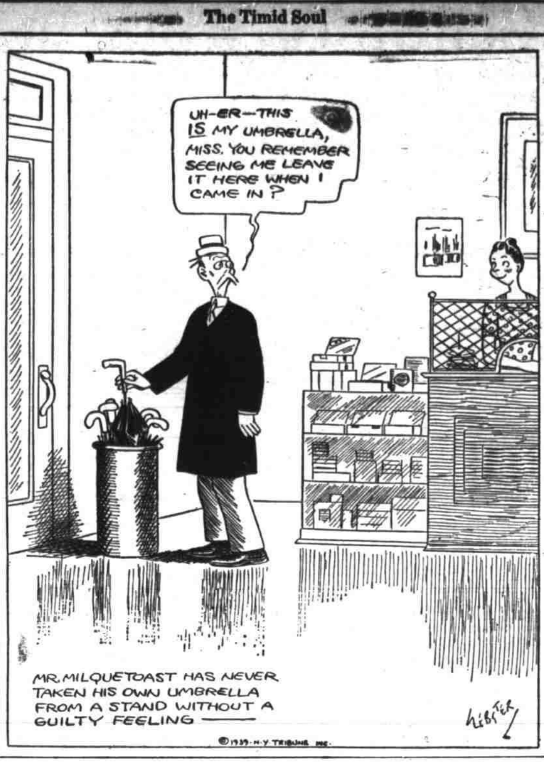
MR. MILQUETDAST HAS NEVER TAKEN HIS OWN UMBRELLA FROM A STAND WITHOUT A GUILTY FEELING

UN-ER--THIS IS MY UMBRELLA, MISS. YOU REMEMBER SEEING ME LEAVE IT HERE WHEN I CAME IN?