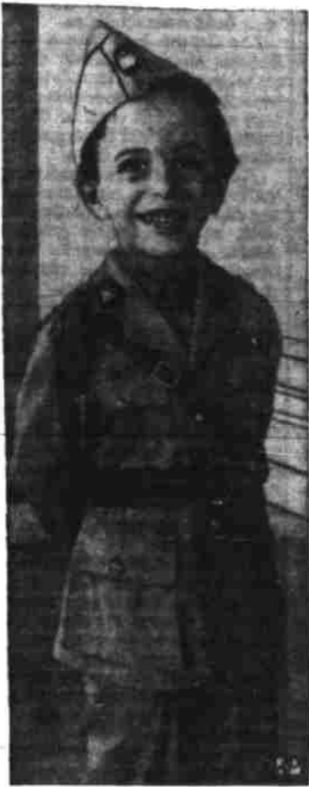
HE'S A KING and every inch a boy, King Feisal II, 4, succeeded to Iraq's throne after father's death in motor crash.