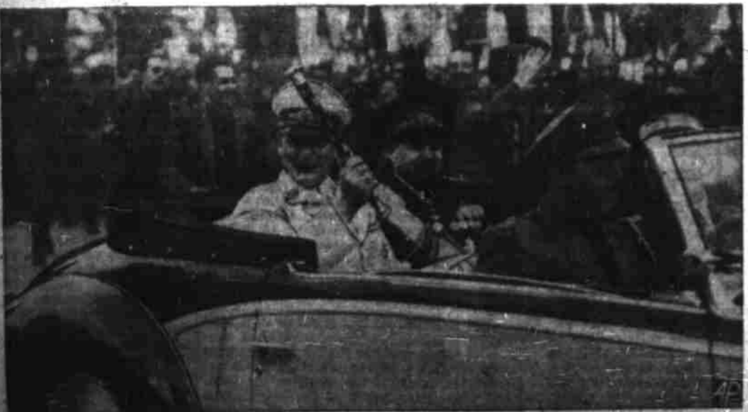
AXIS RIDES OVER AXLE as German Field Marshal Hermann Goering (left), brandishing his baton, waded in a phanion with Marshal Italo Balbo, Italian governor of Libya, through the streets of Tripoli. Goering's visit to the African colony was incidental to conferences concerning the status of the Roma-Berlin axis in Europe's new lineup, bringing new concern to the democracies.