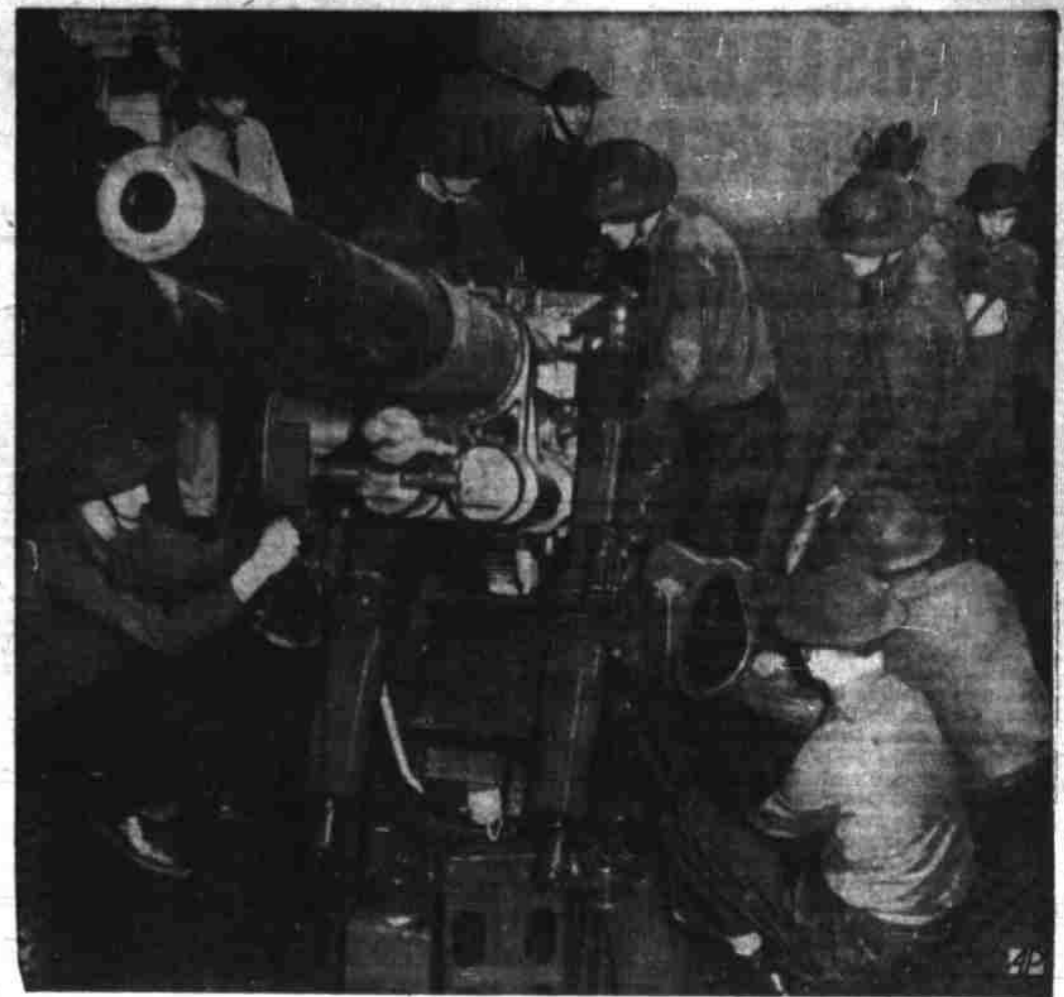
20TH CENTURY MINUTEMEN AT WORK with this new-type anti-aircraft gun can fire 20 rounds a minute, using a three-inch projectile with a range of five miles. These Massachusetts National Guardsmen, members of the 211th coast artillery regiment, are shown at Boston as they received instruction in use of the M2 model. Their commanding officer declared the weapon superior to those used by any other nation today.