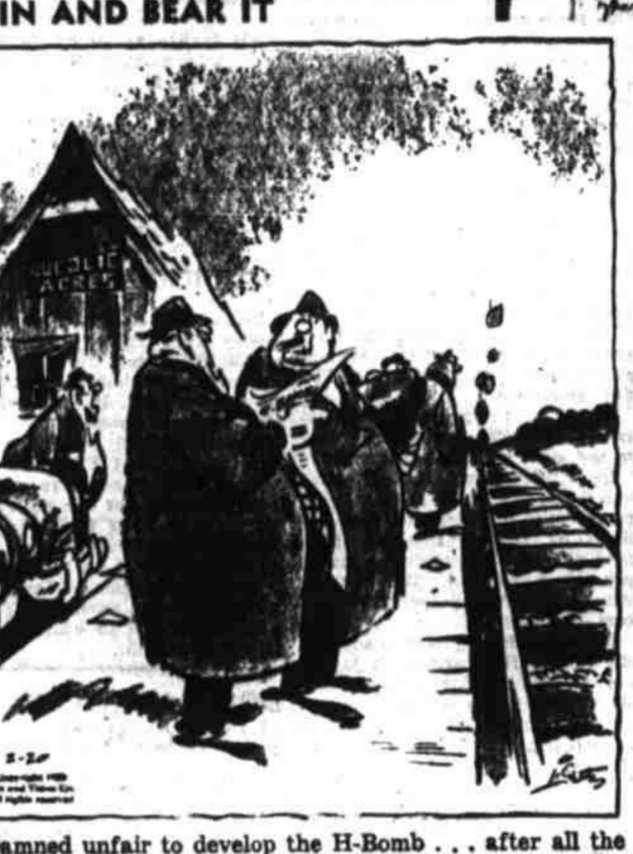
"DAMNED UNFAIR TO DEVELOP THE H-BOMB... AFTER ALL THE TROUBLE WE TOOK TO MOVE OUT OF RANGE OF THE A-BOMB..."