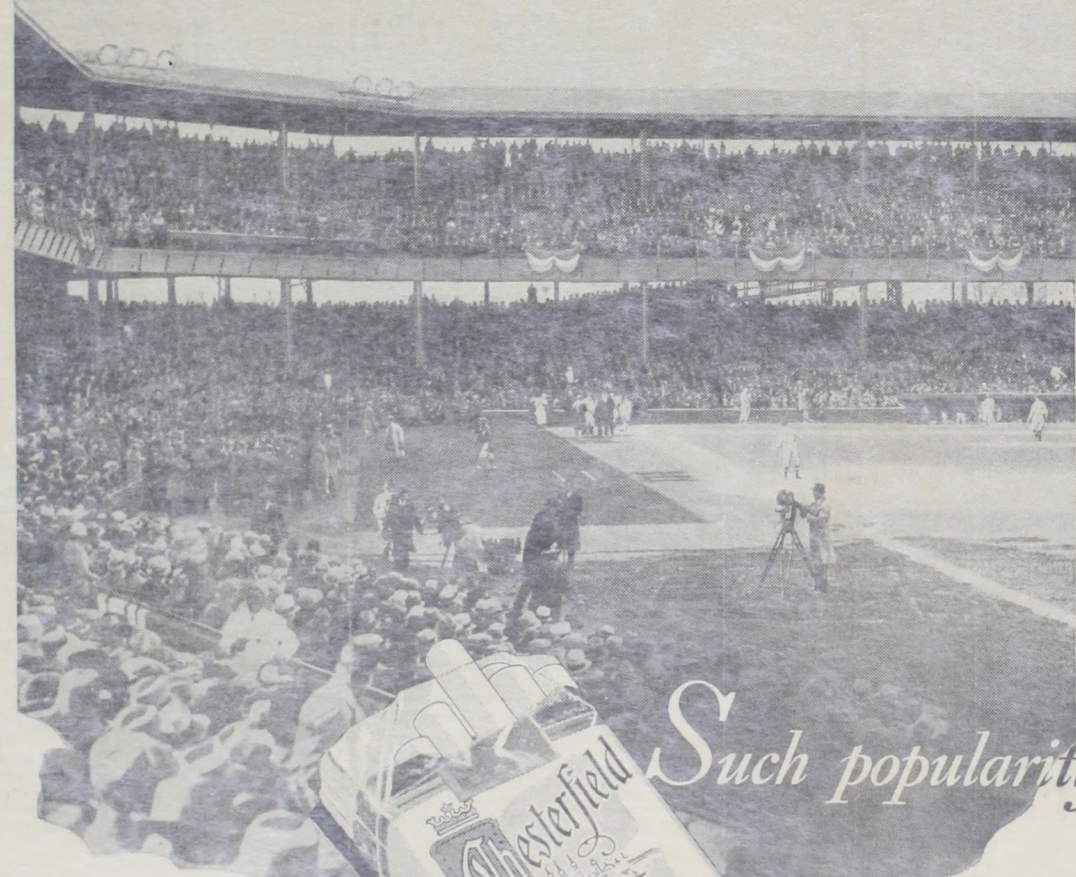
Yankees vs. Senators Griffith Stadium Washington, D. C.

At every game and wherever you go you will find people enjoying Chesterfields. Why . . . because Chesterfields are outstanding for the pleasure they give . . . outstanding for mildness . . . outstanding for better taste. More and more smokers, men and women both, enjoy Chesterfield's pleasing taste and aroma...such popularity must be deserved.