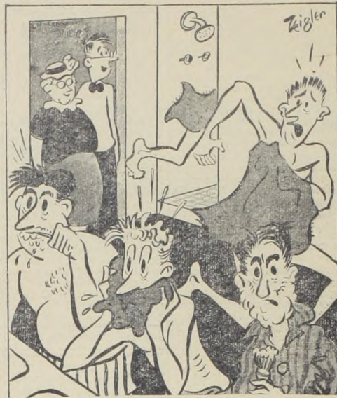
"Fellows . . . I'd like you to meet my mother."

Students should try to grasp the purpose and problems of Texas Tech before making grievances about minor affairs. Sound criticism is essential to improvement but petty criticism is not-