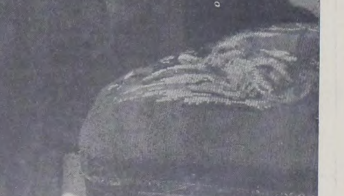
Pictured above is one of the newest styles of wearing apparel among women of this nation. The ensemble pictured was published recently in Good Housekeeping Magazine.