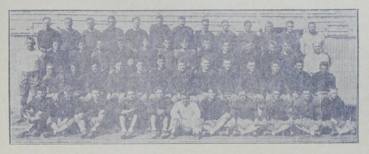
Texas Tech Matadors