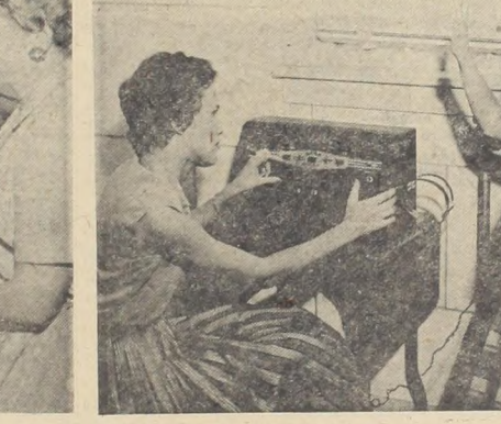
A 9-year-old is being tested with the audiometric hearing machine.