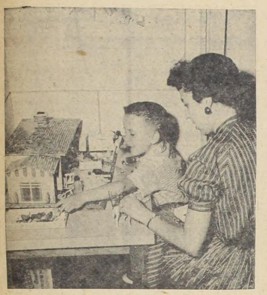
is great fun and also helps correct speech faults

Thursday, June 19, 1958 • The Toreador / • 3