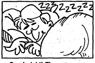
Good night! The average person will sleep some 200,000 hours in a lifetime.